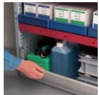
Wheel arch drop front - restrains items stored either side of the wheel arch utilising every last space in the vehicle.