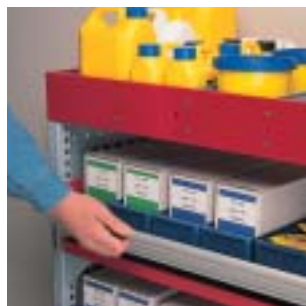
Drop front shelf - allows easier access to shelves where large items are stored.