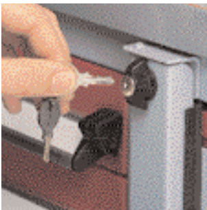
Locking bar - provides extra security for drawers and service cases.