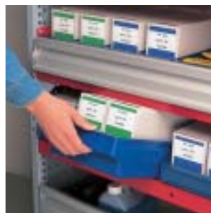
Low front shelf - a simple shelf system that can be used in conjunction with modular plastic bin kits for storage of small components. The shelves may also be divided using the standard low front shelf divider kit.