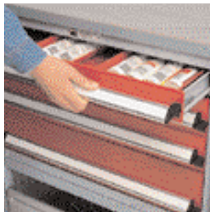
Drawers - available in different sizes with a range of divider options. The drawers open smoothly even when fully loaded.