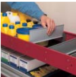
Top Tray - can be divided into sections using standard shelf dividers. An extra high divider kit is available for larger items or box files.

To arrange for a quotation or further details of Bott equipment contact your local dealer at the address overleaf.