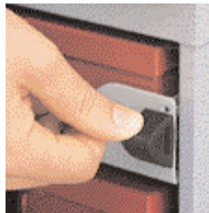
Trigger locks - drawers will not roll open even when left unlocked.