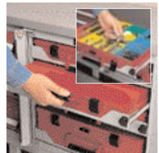
Service cases - available in a range of sizes with optional component bins.