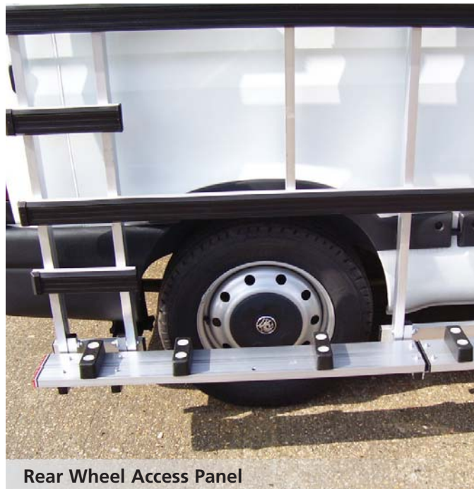
Rear Wheel Access Panel